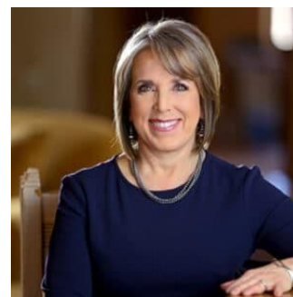
Michelle Lujan Grisham

The new provision of legal representation for parents under New Mexico’s Senate Bill 31 , which was signed into law by Gov. Michelle Lujan Grisham in March, is meant to ensure that voluntary placement agreements “are only used in situations where